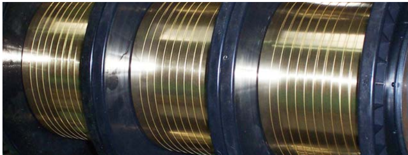
Slit Width Tolerances Dimensions in (mm)